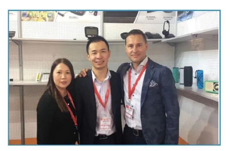
2018.09 Germany IFA Fair