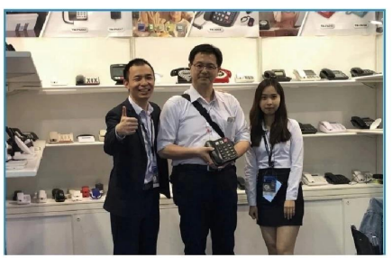
2019.04 HK Electronics Fair