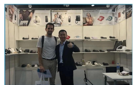
2023.10 HK Electronics Fair