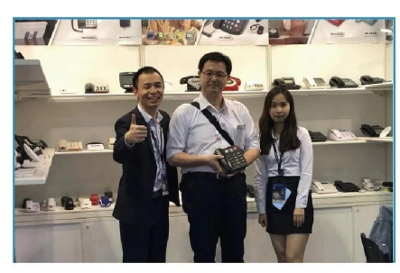
2019.04 HK Electronics Fair