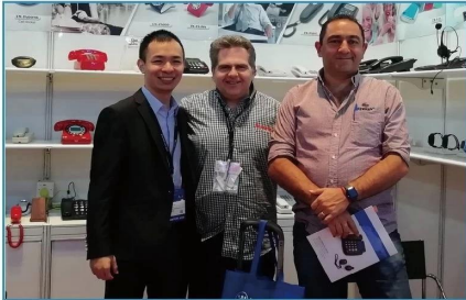
2018.10 HK Electronics Fair