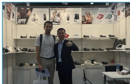
2023.10 HK Electronics Fair