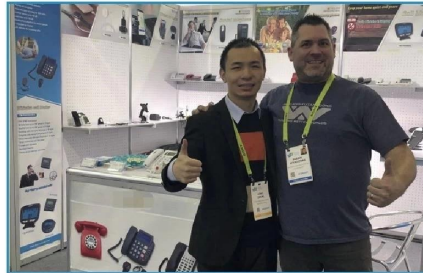
2019.01 USA CES Show