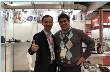
2019.07 Brazil Eletrolar Show