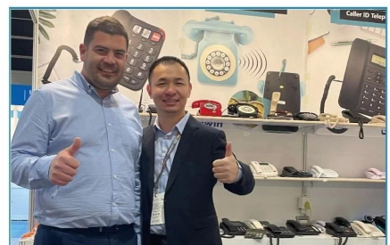
2024.04 HK Electronics Fair