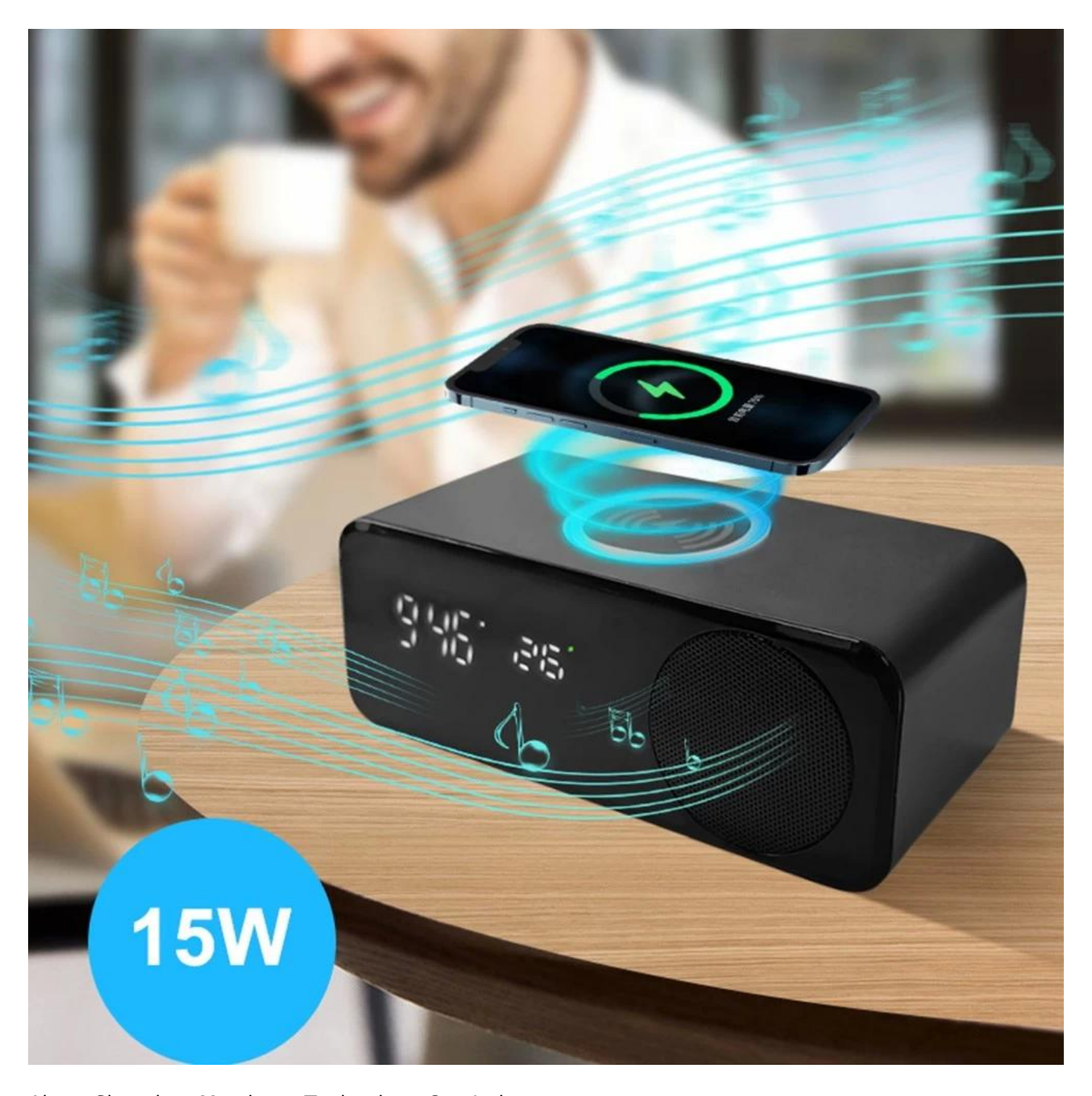
About Shenzhen Musthong Technology Co., Ltd.

Shenzhen Musthong Technology Co., Ltd. is located in Shenzhen, China and focusing on the new wireless charging products such as fast wireless charger, multiple wireless charger, wireless watch charger, wireless charging power bank, wireless charging mouse pad and so on. Our mission is to make you enjoy new wireless fun everywhere.