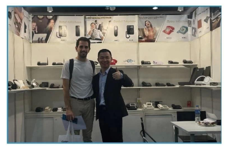
2023.10 HK Electronics Fair