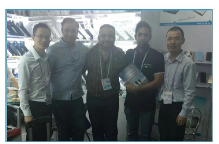
2017.10 Guang Dong Canton Fair