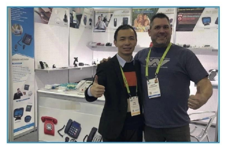
2019.01 USA CES Show