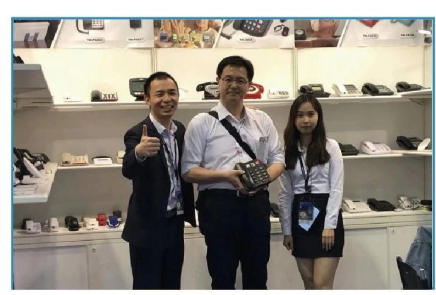
2019.04 HK Electronics Fair