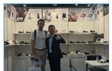
2023.10 HK Electronics Fair