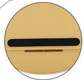
Bottom non-slip mat