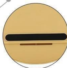
Bottom non-slip mat