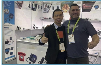
2019.01 USA CES Show