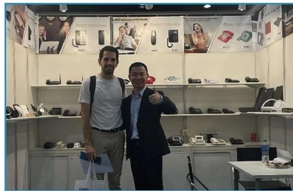
2023.10 HK Electronics Fair