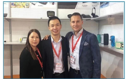
2018.09 Germany IFA Fair