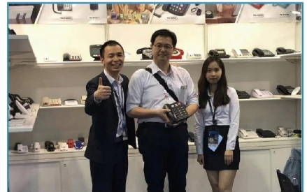
2019.04 HK Electronics Fair