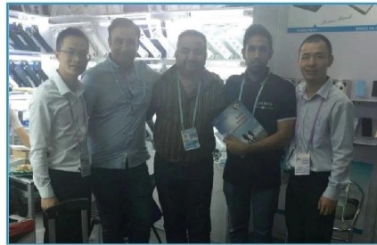
2017.10 Guang Dong Canton Fair