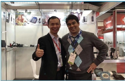
2019.07 Brazil Eletrolar Show