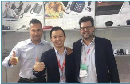
2017.09 Germany IFA Fair