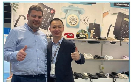
2024.04 HK Electronics Fair