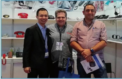
2018.10 HK Electronics Fair