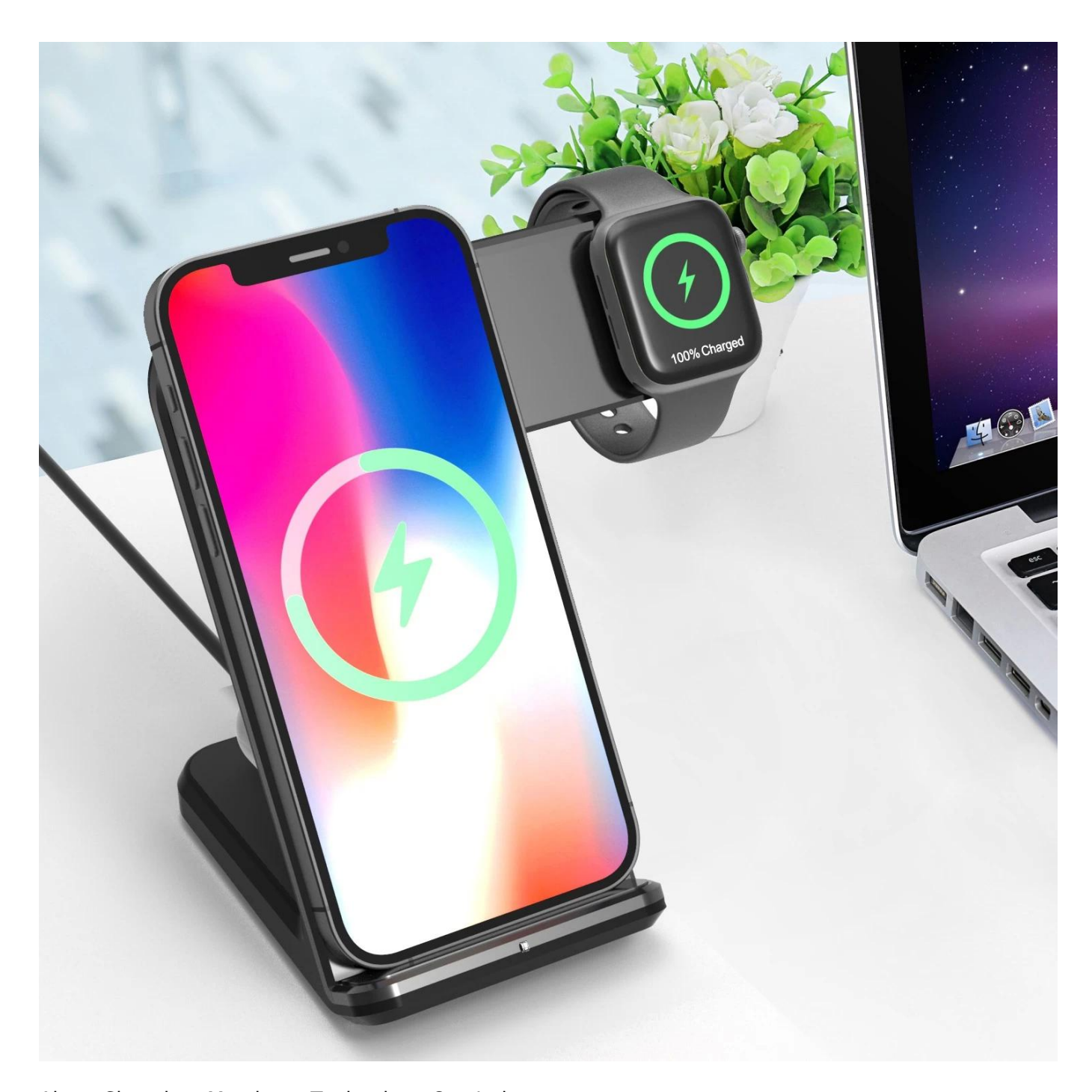
About Shenzhen Musthong Technology Co., Ltd.

Shenzhen Musthong Technology Co., Ltd. is located in Shenzhen, China and focusing on the new wireless charging products such as fast wireless charger, multiple wireless charger, wireless watch charger, wireless charging power bank, wireless charging mouse pad and so on. Our mission is to make you enjoy new wireless fun everywhere.