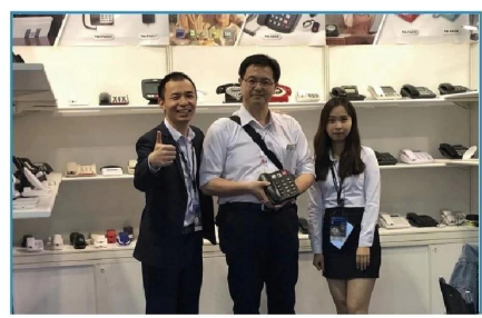
2019.04 HK Electronics Fair