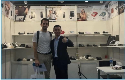
2023.10 HK Electronics Fair