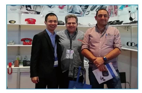
2018.10 HK Electronics Fair